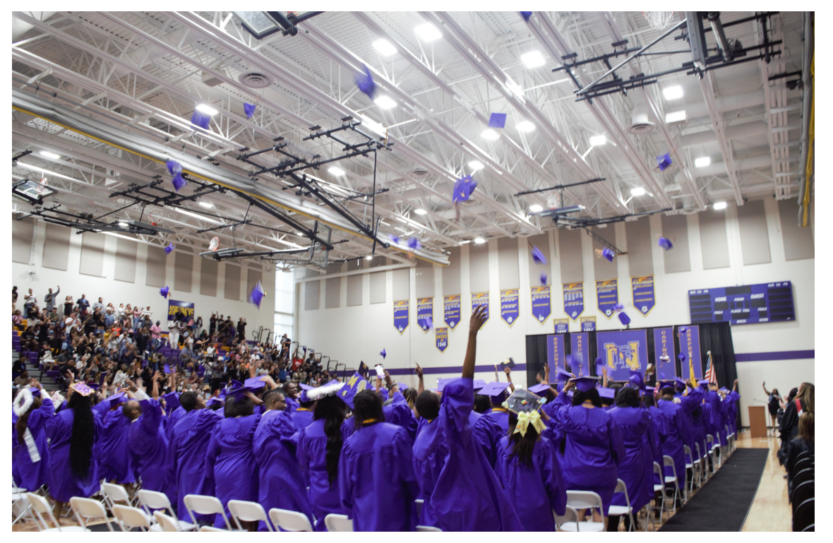
The Class of 2024 celebrates one last time.