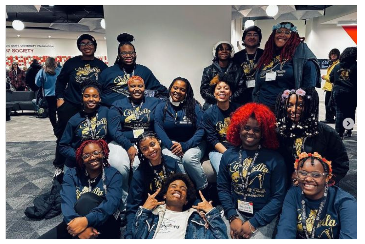
T.F. North Theatre Troop #1672 went to ISU.