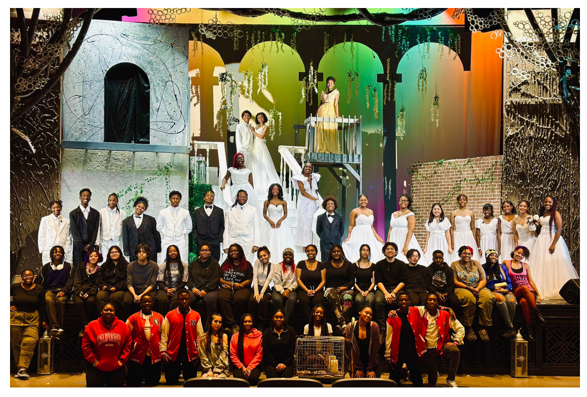
The cast and crew of Cinderella.